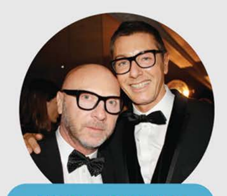
DOLCE & GABBANA (gay fashion designers) March 2015

Which future Prime Minister will have to apologise to the Motherless Generation?