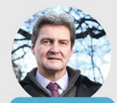
RODNEY CROOME, Australian Marriage Equality, June 2015

Gay people have the right to live as they choose, but no right to silence others who disagree with them on marriage and sexual right and wrong.